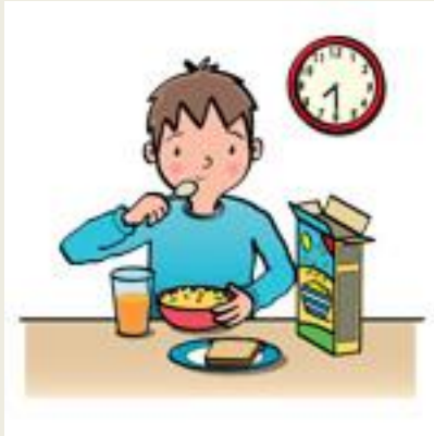
I ate breakfast

Please help reinforce concept of sharing using longer phrases by helping your child share using visual support